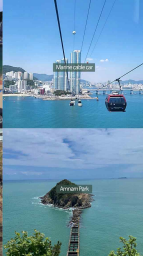
Marine cable car